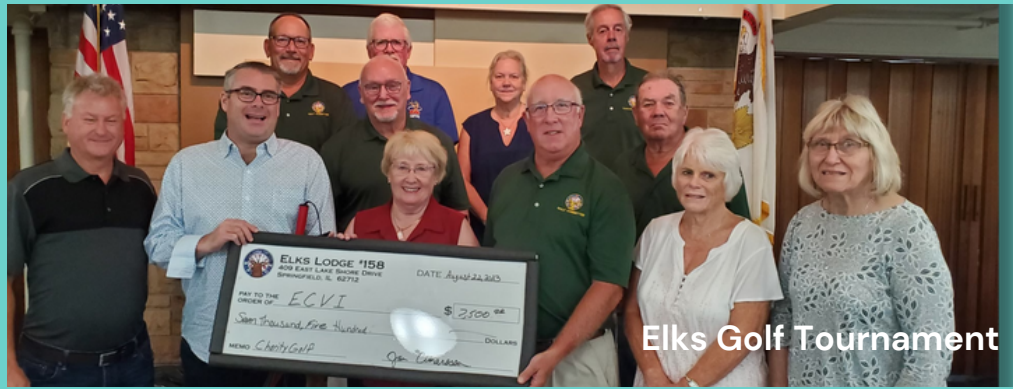
Elks Golf Tournament

Thank you to the Elks Lodge #158 Golf Committee for the incredible support they provide through their golf outing so ECVI can continue to provide educational services for the visually impaired. Through their generous donation, many individuals will be able to receive the education and resources they need to thrive.